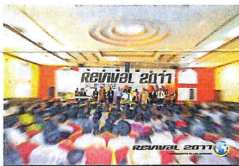
The main hall housed only a portion of the 8,000+ in attendance for each of the two services.

Despite conflict after conflict to just make it to Riyadh, I deplaned & made my way to customs, expecting another brutal process of waiting in line & questioning. To my surprise, an Indian man caught my attention & motioned for me to come to him. He introduced himself as, first, a member of an Indian Pentecostal church there in the city, but also, as a manager in the airport. He walked me past the extensive line & through customs seamlessly.